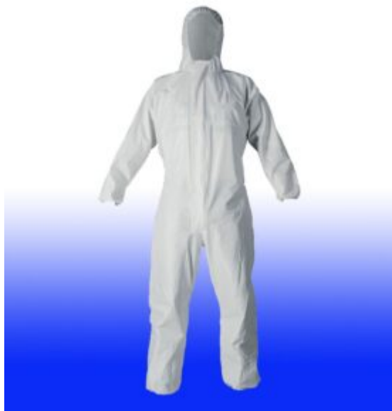
TUTE IN POLIPROPILENE M 50 PZ C/CERNIERA